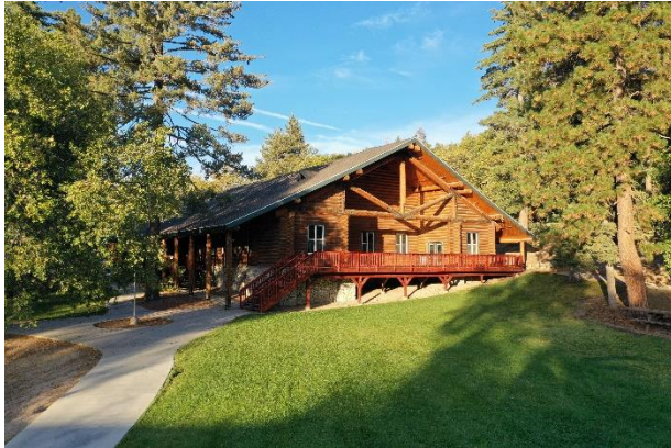
Hume Lake Southern California

Hume's ministry has followed the leading of God to expand its reach to include camps in Southern California and New England . Also, internationally in countries like Thailand and Papua New Guinea through partnerships with missionary organizations. Wherever God leads, the mission is still the same.