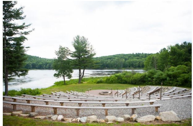
Hume Lake New England

Since the first summer of camping in 1946, more than 1.5 million young people and adults have been exposed to God's love and wonderful plan for their lives through Hume Lake Christian Camps.